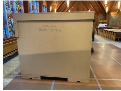
Crated organ console in church