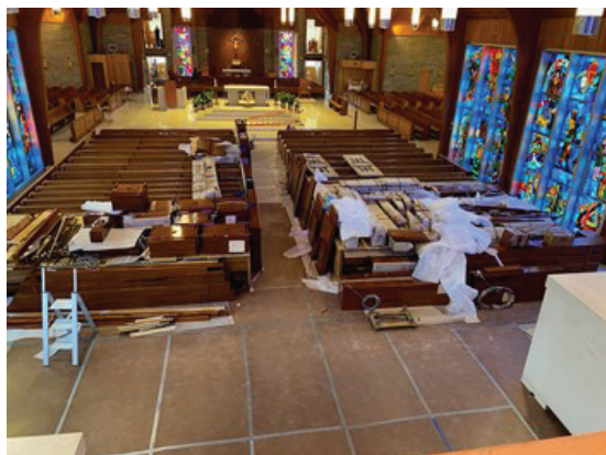
View from the choir loft