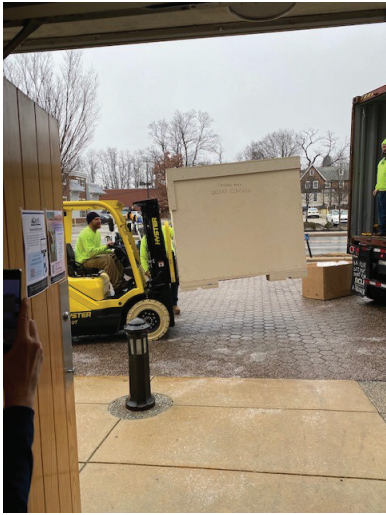
Crated organ console being offloaded