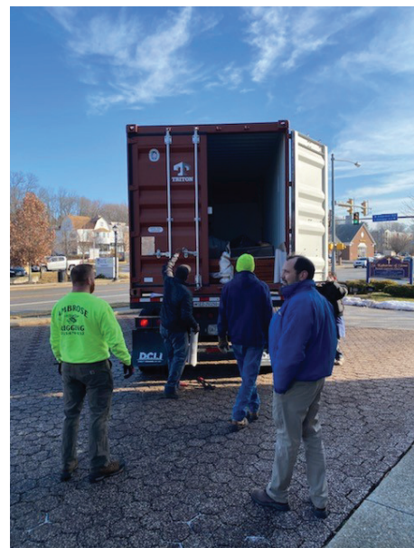
20' container arrives on Tuesday