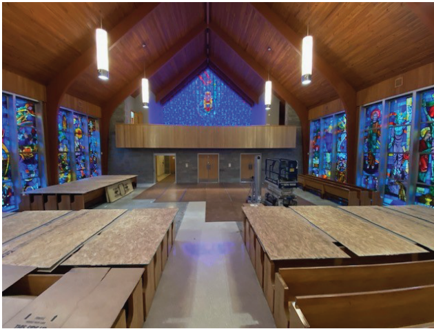
Church with plywood on the pews to hold organ parts