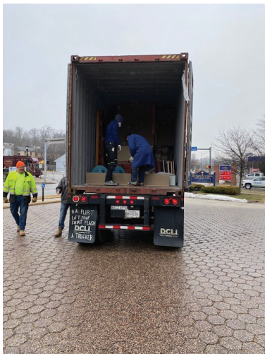
Container seal is broken and opened