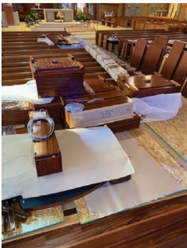
Wind chests and reservoirs