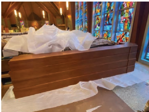
16' wooden pipes