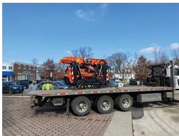
Jekko crane arrives

Please keep this important project in your prayers as we prepare to enhance our praise of God in song accompanied by the beautiful music this new organ will provide!