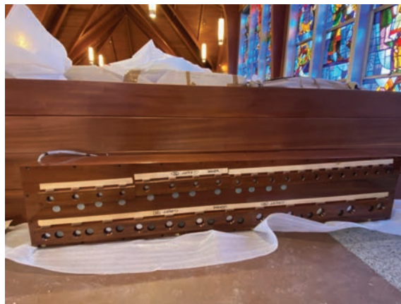
Wind chest for organ great