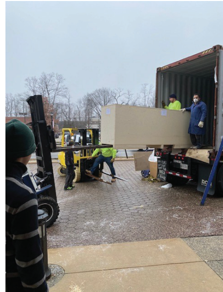
Crated pipes being offloaded.