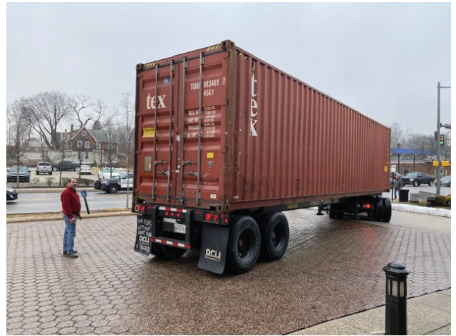
40' container arrives on Monday.