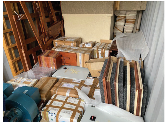
Contents in the container