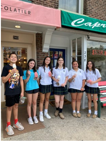
Youth Group tradition to CAPRI!!